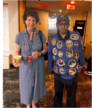
ELLEN S BAKER – History Travel US (historytravel-us.com)