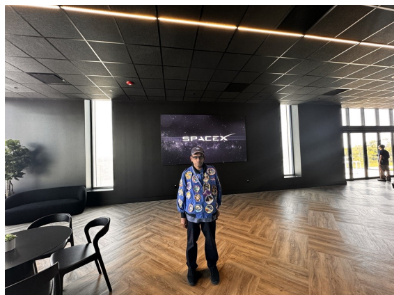
Amazing and Informative Presentation on SpaceX at the lobby of Launch Control followed by a group photo