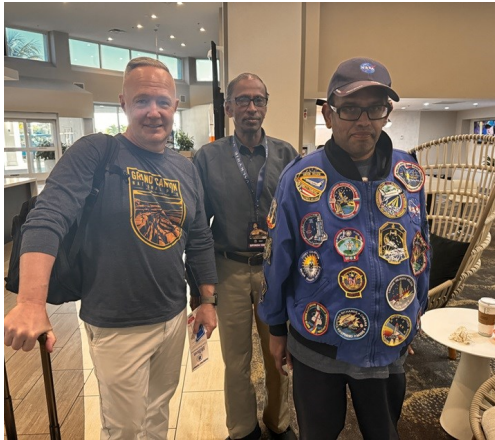
DOUGLAS HURLEY