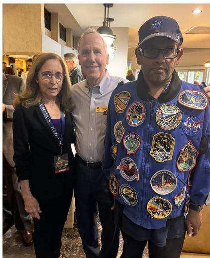
MARSHA IVINS