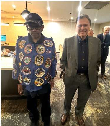
FRANKLIN CHANG DIAZ