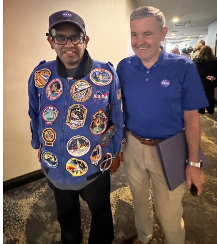
BOB CABANA