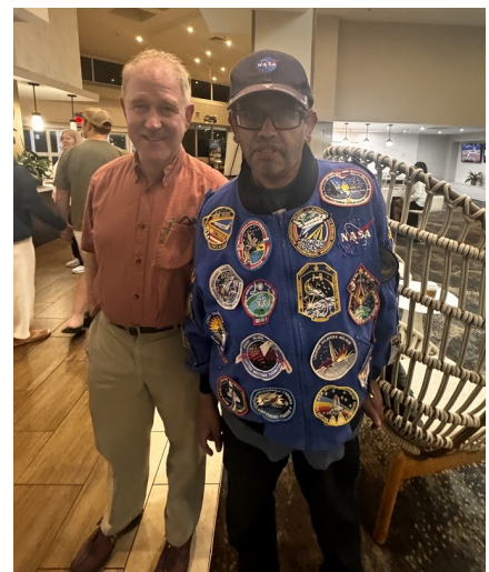
JOHN GRUNSFELD