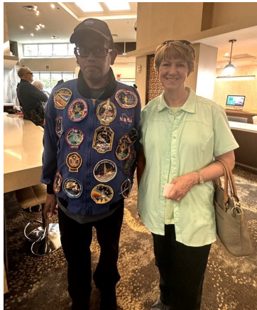
EILEEN COLLINS – History Travel US (historytravel-us.com)