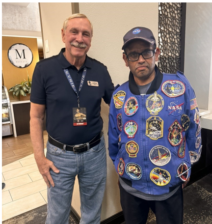
CURTIS BROWN – History Travel US (historytravel-us.com)