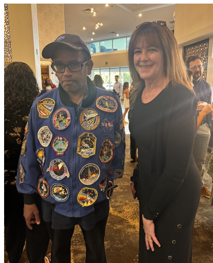
JANET KAVANDI