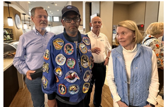
ROBERT HOOT GIBSON – History Travel US (historytravel-us.com)