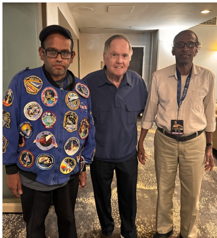
ROBERT CRIPPEN