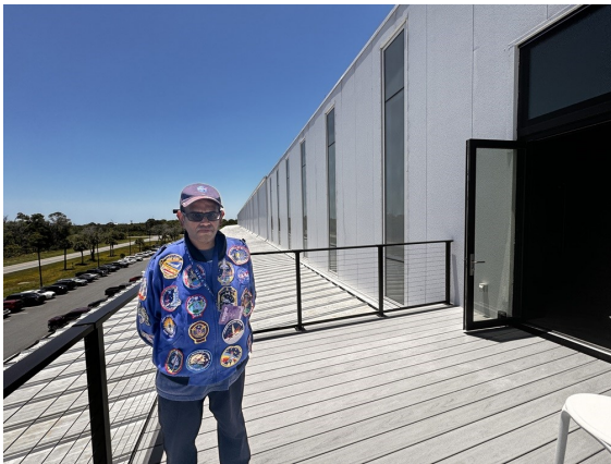
View from Outside of SpaceX Launch Control

Info on all three Launch sites: 39-A, SLC-40 and Vandenberg